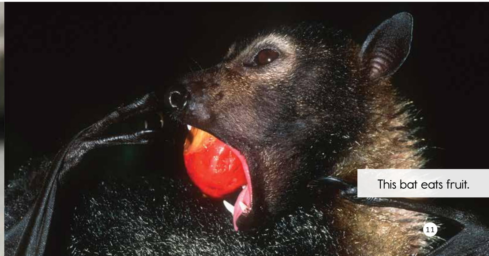
This bat eats fruit.

Some bats eat fruit. They need sharp teeth, too. The teeth can break the skin of the fruit.